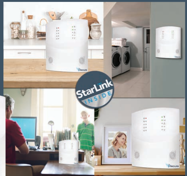
GO-ANYWHERE SMART HUB (Included in all 3 Kits)