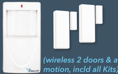
(wireless 2 doors & a motion, incld all Kits)