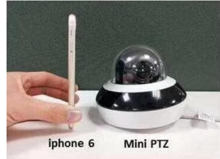
Compact and Elegant Design