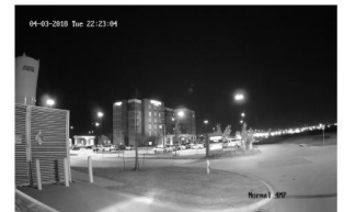
vs Conventional PTZ