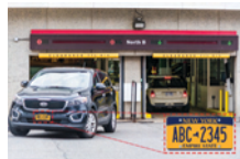
Capture and recognize vehicle plates