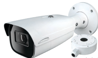
Included Junction Box