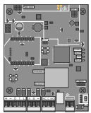
one door network PN: R1E

Additional Red Expander Boards sold separately