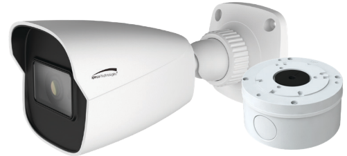
Included Junction Box